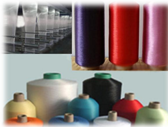
Fiber Yarn Textiles