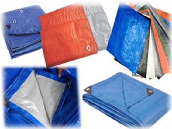
Coating * Lamination